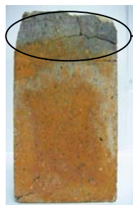
Crack and infiltrated layer at hot face